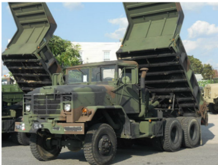
M929- Dump Truck