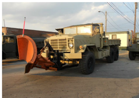
M923- Cargo Truck With Plow