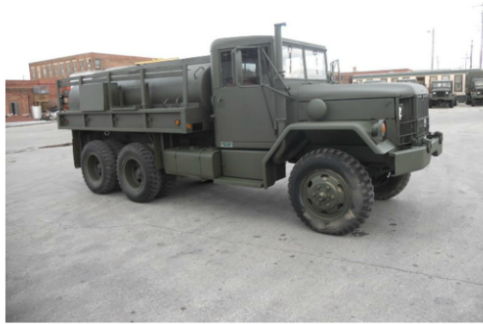
M49C- Fuel Tank Truck