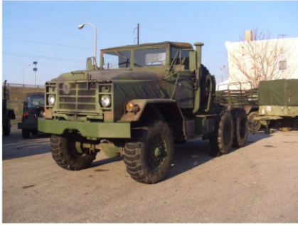
M931- 5 th Wheel Tractor