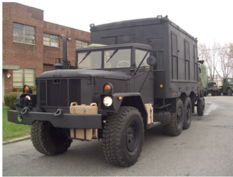
M109A4- Van Truck