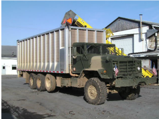
M923- Cargo Truck With Extended Frame And Custom Body