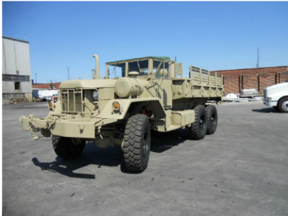
M813 - Cargo Truck With Front Winch