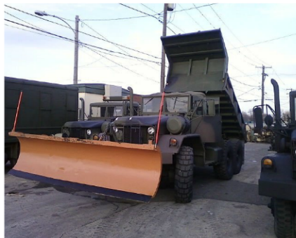
M817- Dump Truck With Plow