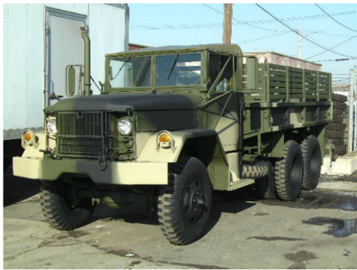
M35A2- Cargo Truck