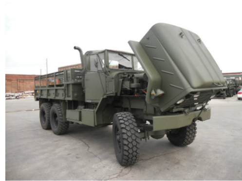
M923- Cargo Truck