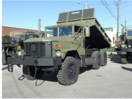
M35A3- Cargo Truck with Dump Truck Conversion