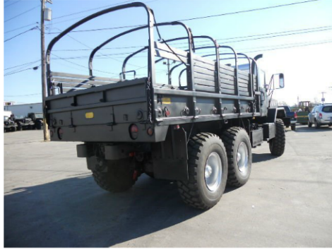
M923- Cargo Truck