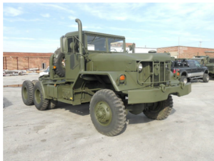
M818- 5 th Wheel Tractor