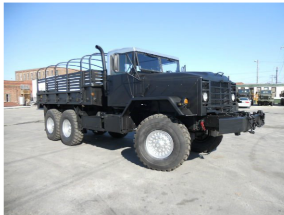
M925- Cargo Truck With Winch