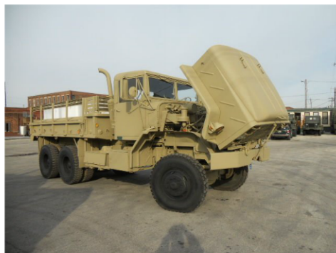
M923- Cargo Truck