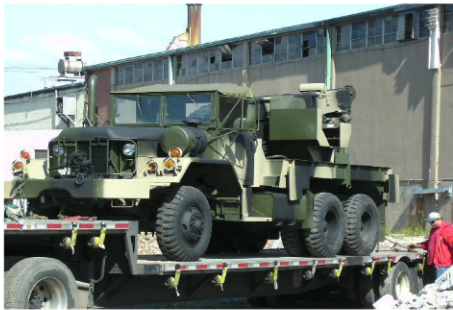
M816- Hydraulic Wrecker Truck