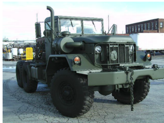
M923- Cargo Truck With Extended Frame And Custom Body