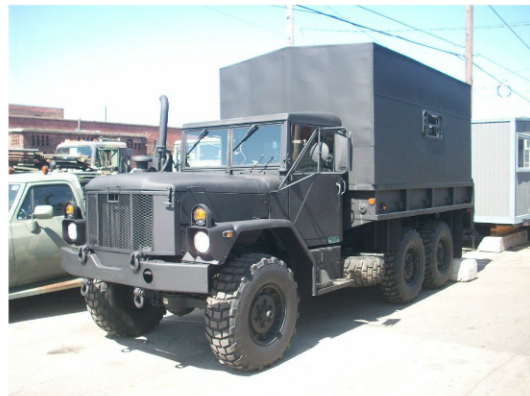
M35A3- Cargo Truck With Van Body